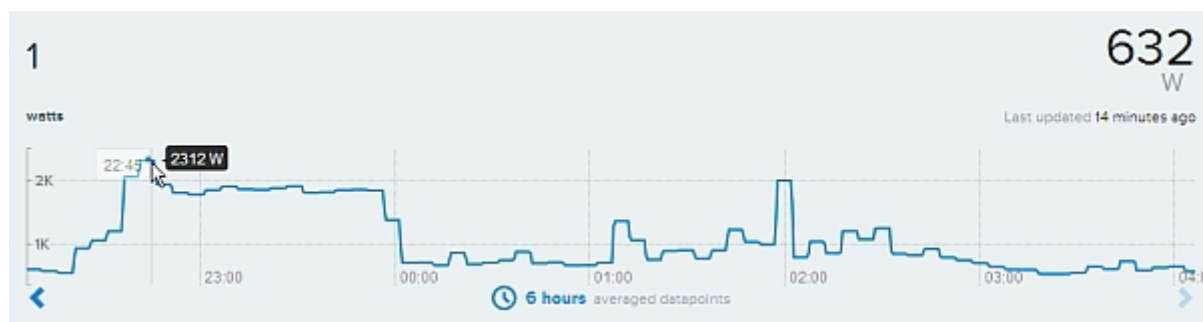
6 Hours Of Electricity Consumption

The data / graphs can be manipulated to show data over periods of 5 & 30 Mins, 1,6 & 24 Hours and 7 Days to 1 & 3 Months.